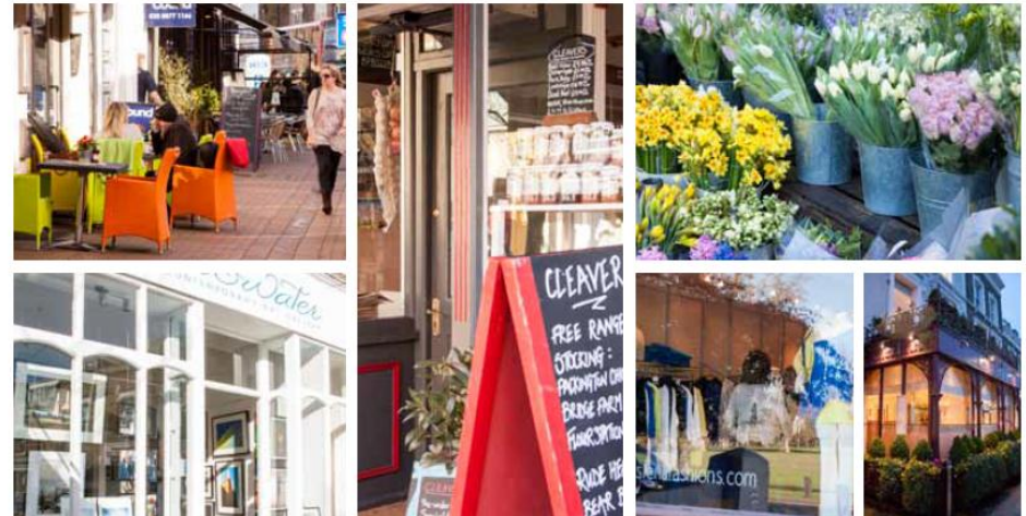
Images depict local area

Earlsfield is an attractive residential neighbourhood approximately five miles from the centre of London. In recent years it has become an extremely desirable place to live, with an influx of fashionable new shops, bars and restaurants to serve a clientele of urban professionals.