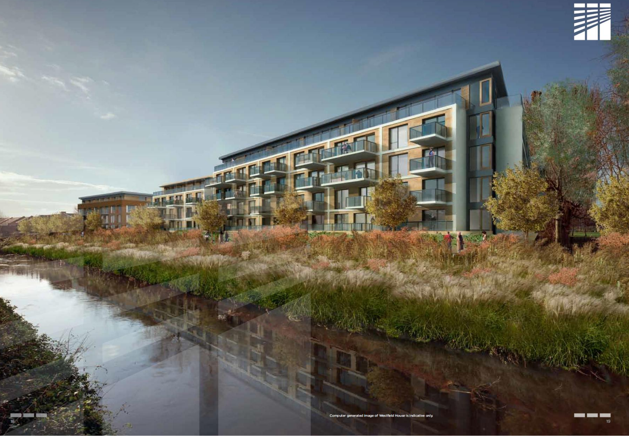
Computer generated image of Westfield House is indicative only