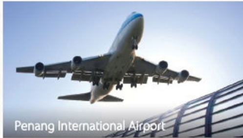
Penang International Airport