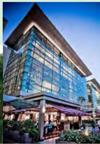
Bangsar Shopping Centre