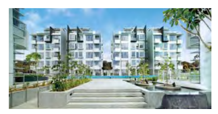
POSHGROVE EAST - East Coast Road (Condominium)