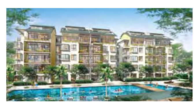
TREASURE PLACE - Chwee Chian Road (Condominium)